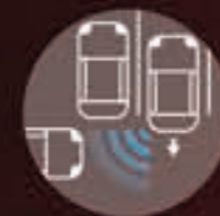
Rear Cross Traffic Alert