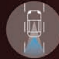
Intelligent Rear View Mirror