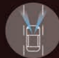
Lane Departure Warning