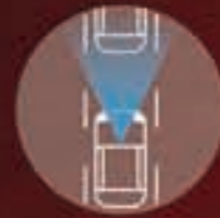
Intelligent Forward Collision Warning