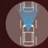
Intelligent Emergency Braking