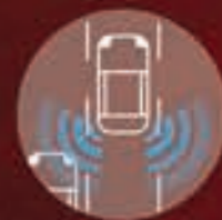
Blind Spot Warning