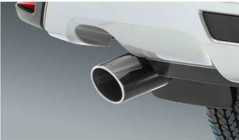
Exhaust Pipe Finisher Adds a bolder and eye-catching aesthetic to your family SUV.