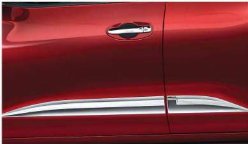
Body Side Molding Designed to enhance your SUV's overall appearance and attitude.