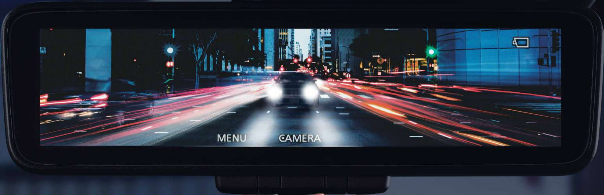
Intelligent Rear View Mirror "ON"