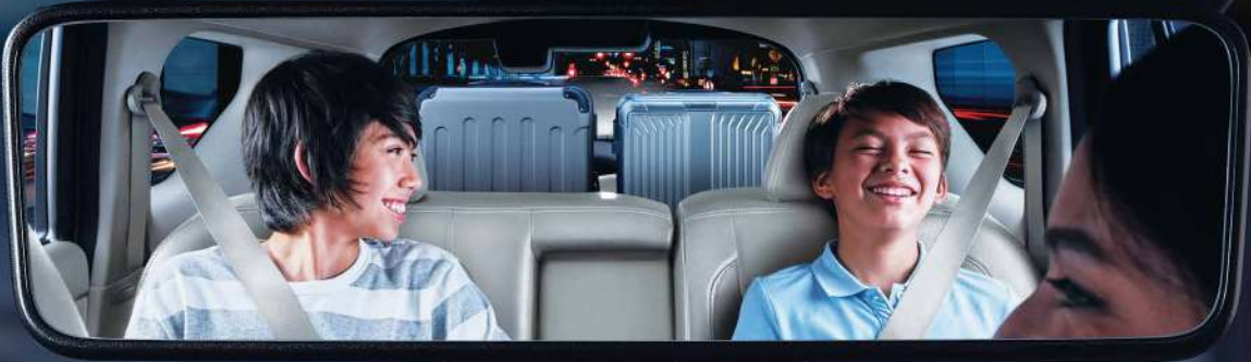
Intelligent Rear View Mirror "OFF"