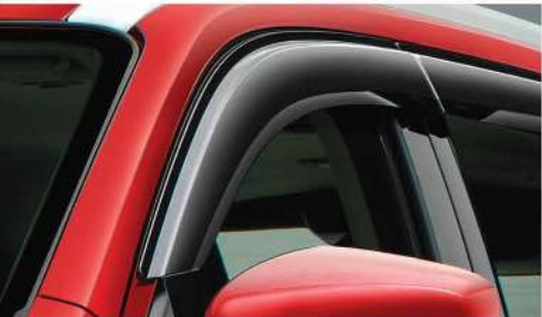
Door Visor Keeps the rain out and fresh air in.