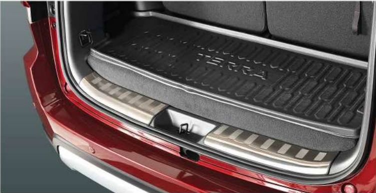
Luggage Tray Prevents spillage on the trunk's carpet.