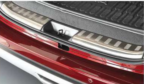
Rear Kicking Plate Protects the back door floor panel from scratches while adding style to your vehicle.