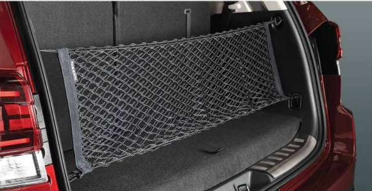
Luggage Net Keeps your groceries, gear, and accessories properly sorted in the trunk.

Give your new family SUV a bolder look with these accessories.