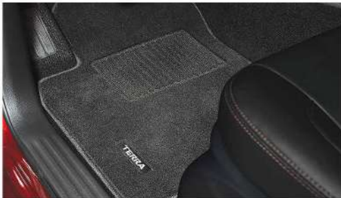
Floor Mat Protects your carpet from premature wear and stains. Equipped with retention clips to keep it in place.

Command everything with style that matches the New Terra's capabilities and premium features. Enhance its exterior and interior according to your preference with these genuine accessories.